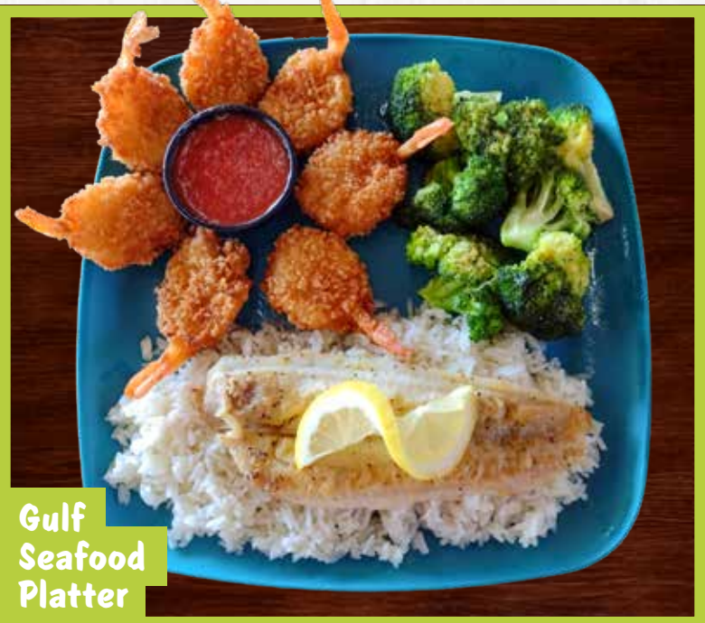
Gulf Seafood Platter